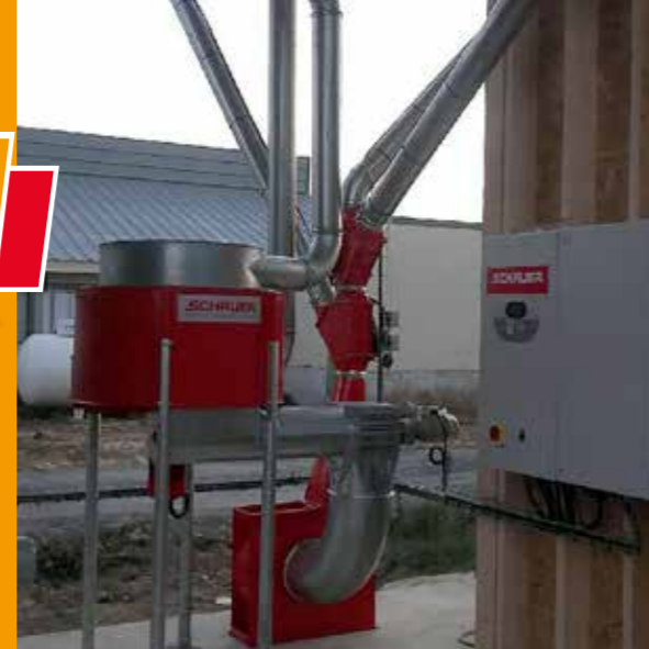
Manual littering with litter hose