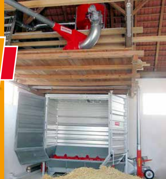
Bale breaker & transfer unit with suction pipe