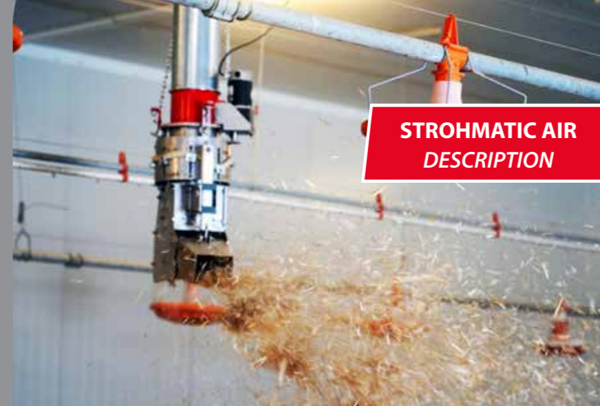
Strohmatic Air ASD